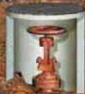
Buried Valve Cover