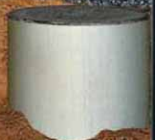
Buried Manhole Cover